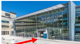
Clinical Pharmacological Trial Unit